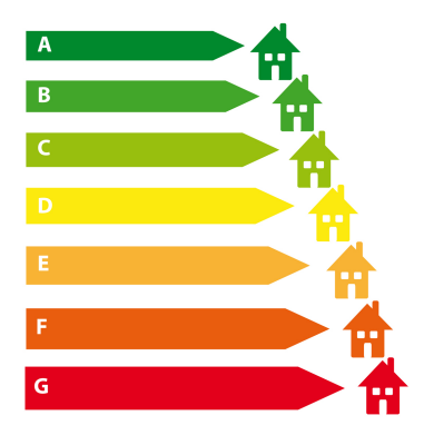
Figure 3: EU-labels for buildings

interviewees, these forms are not difficult to complete; any building professional could do it based on their education. The software performs calculations in the background and presents the viewer with the result. Figure 4 shows an example of the calculation sheet for sustainability, from the DuMo calculation package.