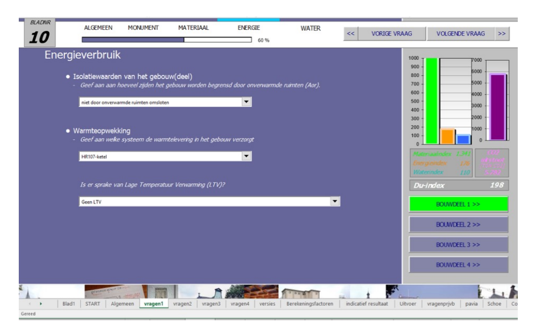
Figure 4: Example of sustainability assessment sheet used to calculate energy demand In this part, the insulation values of the building and the installations for heat provision are described. The graph on the right shows the Sustainability Index (Du Index) for building part 1 (Bouwdeel 1)